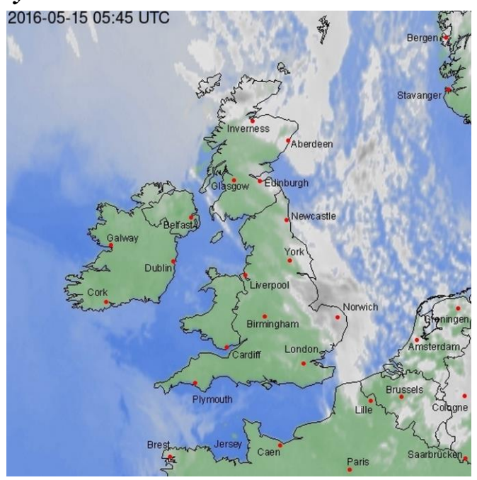
In fact these conditions extended over the channel and England presenting an excellent flying day. Race controllers were updated and the B.I.C.C. convoy were away at 07:30. Wind direction light and variable over France and over the channel veered from direct westerly

The forecast for Sunday was spot on as the heavy leaden skies that plagued northern France on Saturday moved away over night south eastwards. At first light over Alencon the picture was now one of blue skies for Sunday's race.