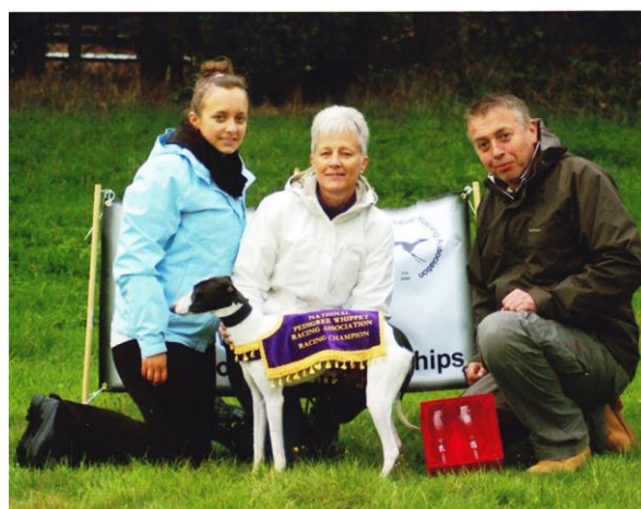
"Bolt from the Blue"

We suffered heavy loses to the race team last season and after looking at the predicted forecast for the race, I chose to send only experienced channel birds, which ended up being just two older cocks. Our 2nd National winning bird is a 3 year old blue Vandenabeele cock racing widowhood. He scored as a