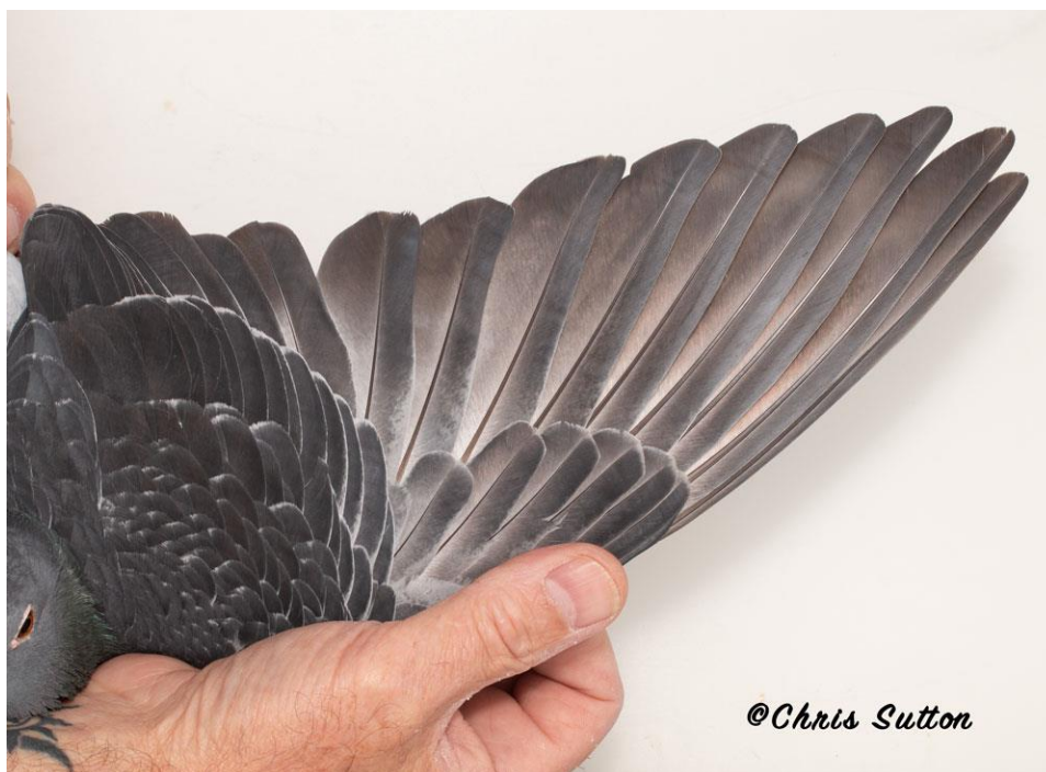
GB15N11222- Wing of "Oasis"