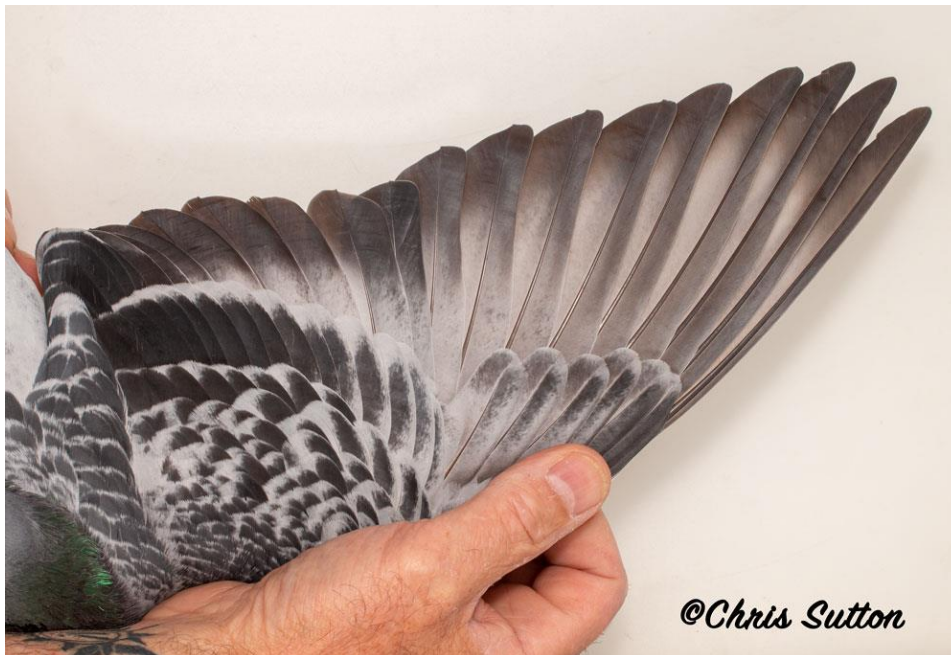
GB14N16574- Wing of "Ronald"