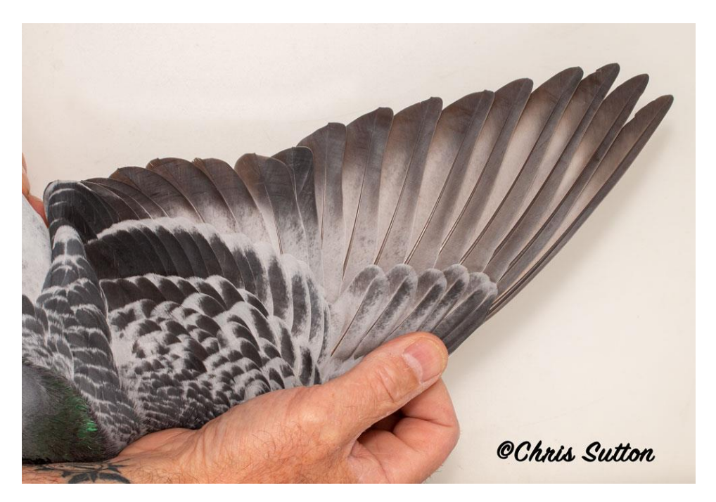
GB14N16574- Wing of "Ronald"