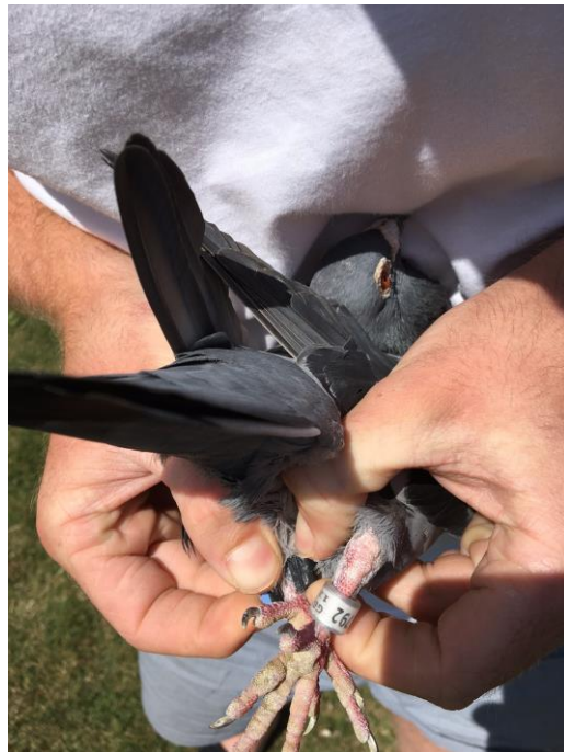
The 792 (G M Preece & Son) having his ETS ring removed for retirement