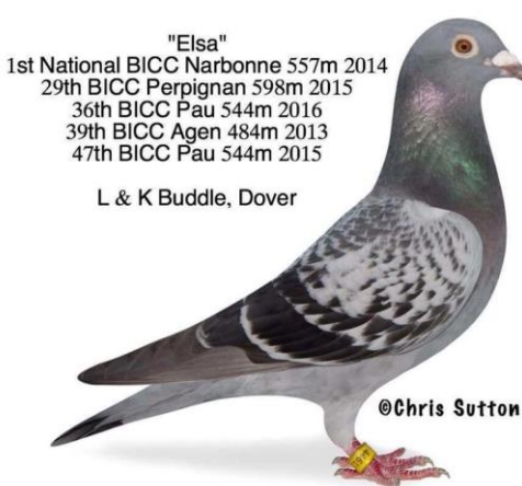
"Elsa" 1st National BICC Narbonne 557m 2014 29th BICC Perpignan 598m 2015 36th BICC Pau 544m 2016 39th BICC Agen 484m 2013 47th BICC Pau 544m 2015 L & K Buddle, Dover