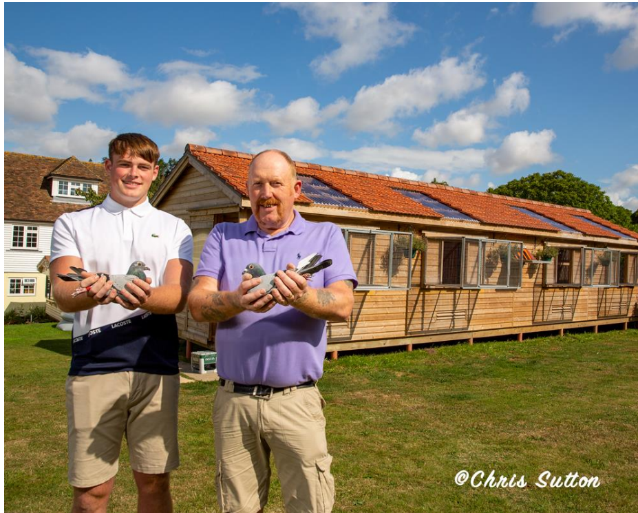
G M Preece & Son 1 st Open 1 st ES BICC Perpignan International 2019

The last International race of the 2019 season took place from Perpignan with most of the British International Championship Club members flying around six hundred miles or more and they were liberated at 6:30 UK time into a blue sky with no wind and good visibility. The BICC entry joined the International entry to make a total of 12752 birds being liberated to return to lofts all over northern Europe. Following on from the winner's report with 1st east section and 1 st Open were G M Preece & Son with "Sunny Jim", a blue white flight cock raced on a widowhood system having his second International race.