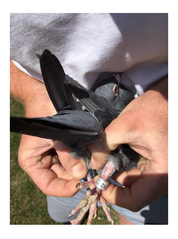
The 792 (G M Preece & Son) having his ETS ring removed for retirement