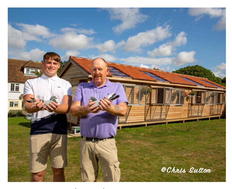
G M Preece & Son 1st Open 1st ES BICC Perpignan International 2019

The last International race of the 2019 season took place from Perpignan with most of the British International Championship Club members flying around six hundred miles or more and they were liberated at 6:30 UK time into a blue sky with no wind and good visibility. The BICC entry joined the International entry to make a total of 12752 birds being liberated to return to lofts all over northern Europe. Following on from the winner's report with 1st east section and 1<sup>st</sup> Open were G M Preece & Son with "Sunny Jim", a blue white flight cock raced on a widowhood system having his second International race.