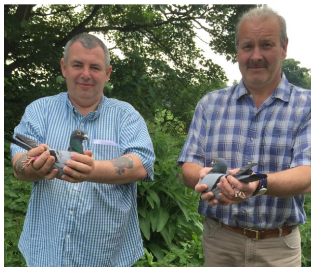
Talent & Westbury 3rd NW Guernsey YB National 2019