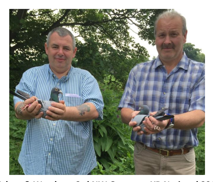
Talent & Westbury 3rd NW Guernsey YB National 2019