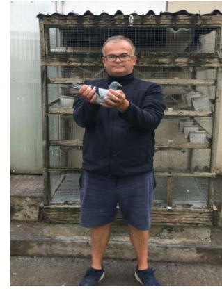
Brooks Bros & Wilcox