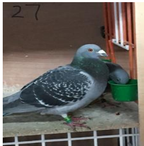
Staaljiager 1 st Open winner