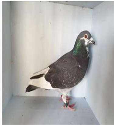
Simmons & Sparks' pied cock