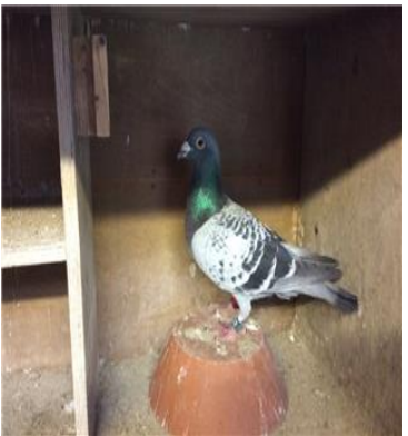
Brian Smith's chequer cock