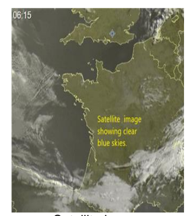
St Malo Saturday morning