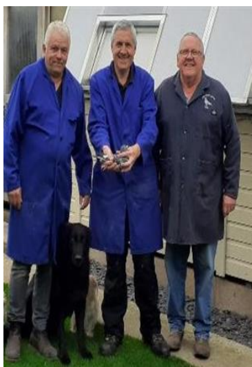
S Luff & Walker Bros