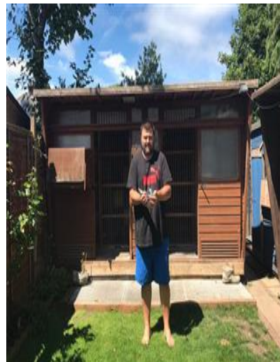
Emberson & Firat