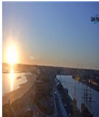
St Malo Saturday morning