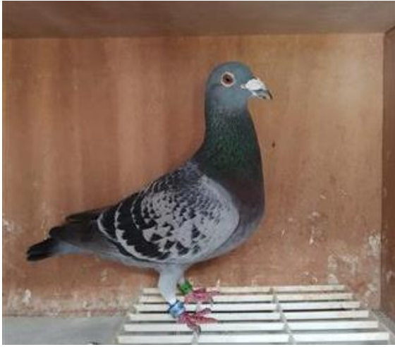
Khan Bros bird