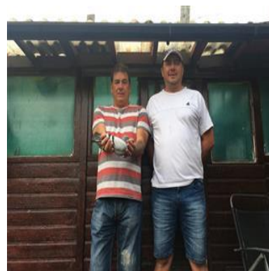
Preece Bros & Son