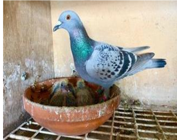
1 st Open winning hen