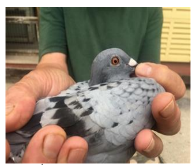
1<sup>st</sup> Open Countances