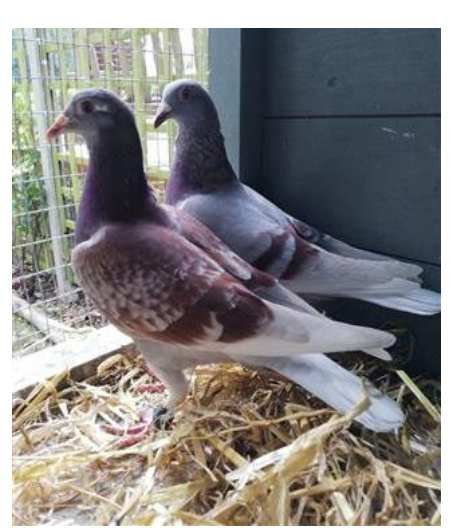
Ian Butler's two hens