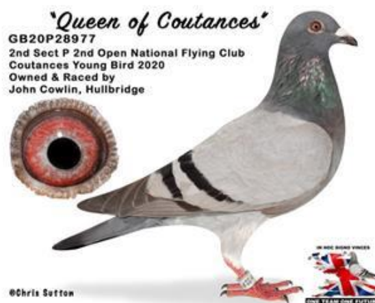
And now 1 st Open BICC Coutances