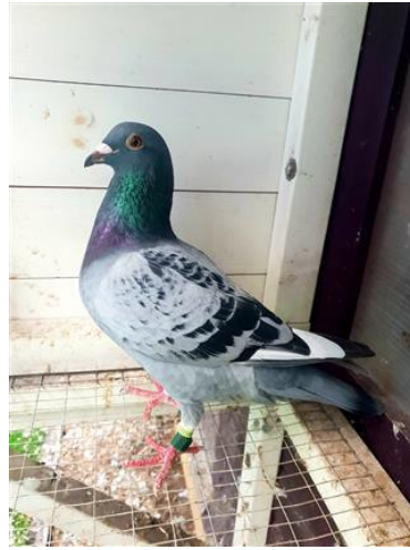
Iron Saviour 1 st Open winner