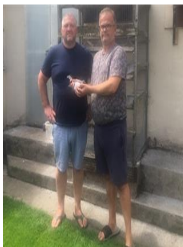
Brooks Bros & Wilcox