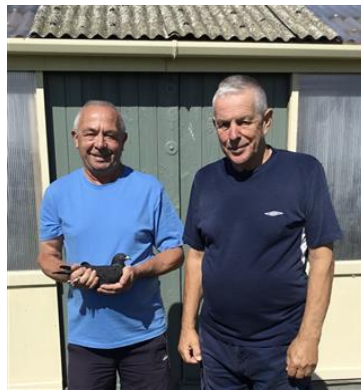
Booth & Roper