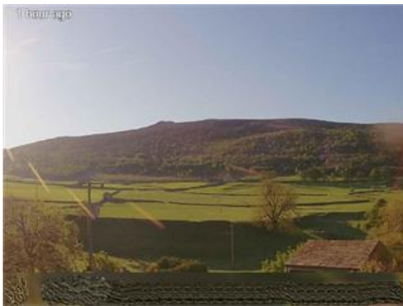
Webcam located 50 miles south of Hexham Appletreewick: Skyreholme Webcam

The forecast for Saturday's race from Hexham proved correct as the weather satellite identified clear blue skies at the race point and on the flight path to the south of England. Mark Gilbert and myself agreed to inform the convoyers that the race was to go ahead. Liberation was affected at 07:00 and the convoyers reported a good clearance. The webcams at various locations on the line of flight showed the visibility was excellent including the one at Appletreewick some 50 miles south of Hexham, as you can see from the image. Winds were very light and direction difficult to determine, but the main influence was from the west.