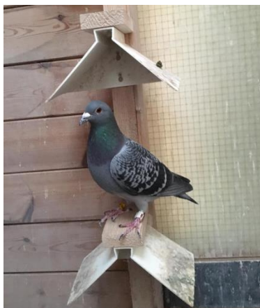
Gary Downing's hen