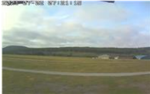
View at Dinnet Gliding Club, some 50 miles south of Elgin

under broken cloud and some sunshine all the way to Perth. Visibility was very good as can be seen from the image captured by the webcam positioned at the Dinnet Gliding club some 50 miles south of Elgin. Winds light mainly from the south or at times the south east. On monitoring the flight path throughout the day generally weather conditions were good for racing. A tough race and although the winds were relatively light they did create resistance to the birds in flight.