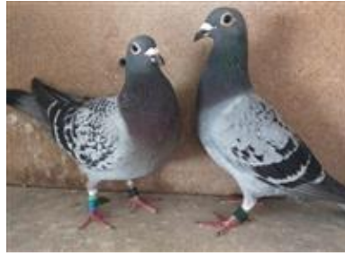
Booth & Ropers 2 hens