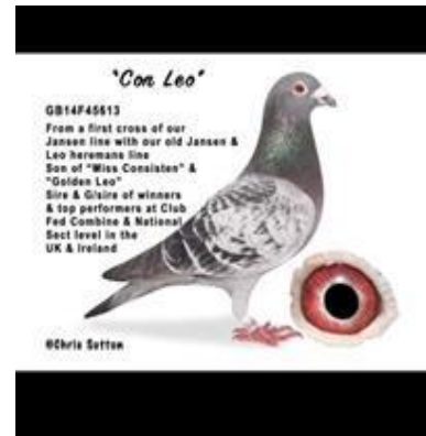
'Con Leo' of D Wilton & Son