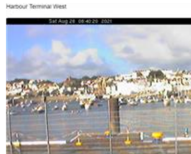
Harbour Terminal West

This report is based on member's first bird verifications and the final result may differ.