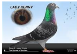
Parent of Team Wicker & Wight's first bird