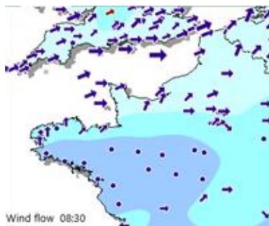
Wind flow map