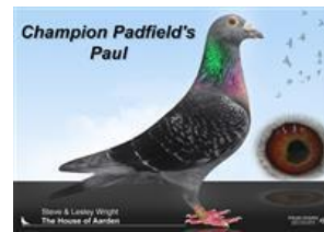
Parent of Team Wicker & Wight's first bird