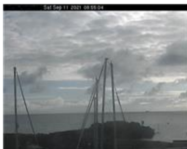
View from Beaucette Marina