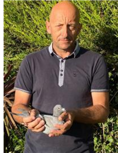
Chapman & Eastoe