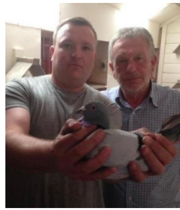
M Connolly & Son