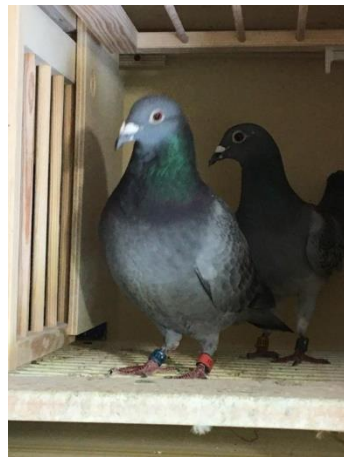
The National winning bird