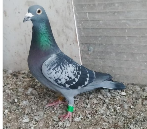
Williams Bros, widow cock