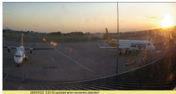
View of Aurigny airport