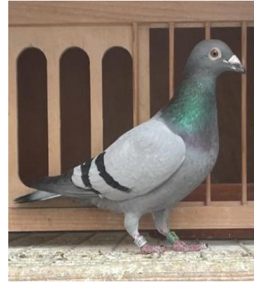
Shaun McDonough's bird