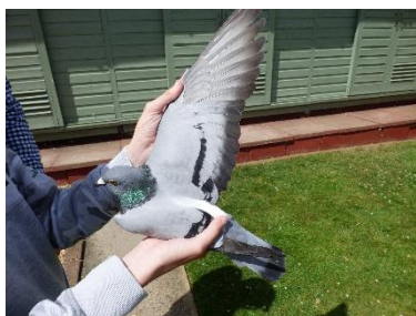
The National Winner