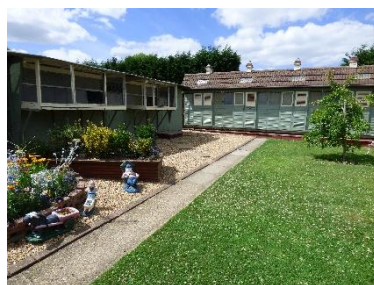
The Hardy & Wilson Lofts