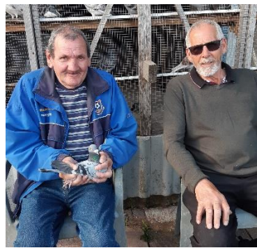
Smith & Jones