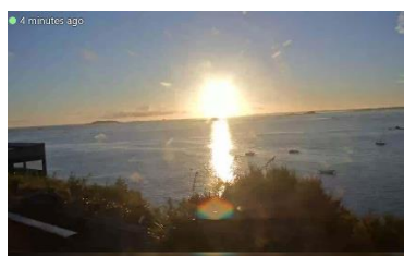
View of St Malo

The NFC, BICC, CSCFC & BBC convoy was liberated from St Philbert at 07:30. The convoyers reported the birds cleared the site immediately in a northerly direction under clear blue skies. These good conditions continued all the way through northern France to the channel. See view looking out to sea from the webcam located on the flight path at St Malo. Channel conditions were clear with visibility recorded by the meteorological buoys at 11 miles or more. The other view captured from Cherbourg – en – Cotentin webcam on the peninsula displayed the clear visibility. The weather over England identified a front moving across the country from west to east carrying showery activity which as forecast did dissipate as the day progressed. Temperatures averaged 18 C. Winds were mainly light from the southwest over northern France but did increase in velocity over the open sea to about 15 mph. Over England again winds came mainly from the SW but on occasions did veer to SSW over eastern regions. (See wind flow chart) As is always the case the wind direction determined where the winners were timed in.