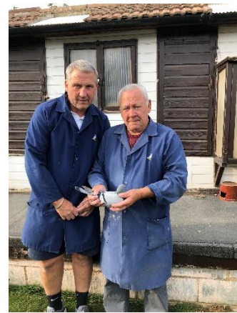
D Heywood & Son