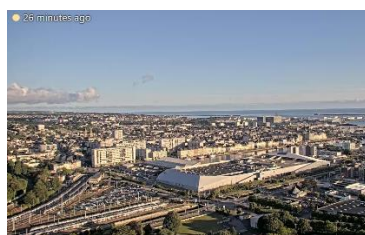
View of Cherbourg