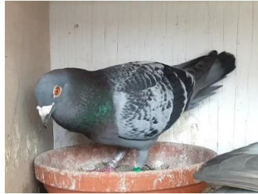
Williams Bros bird