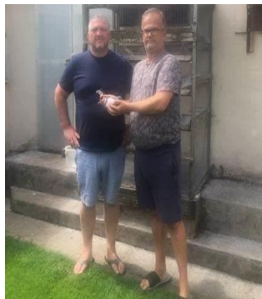
Brooks Bros & Wilcox