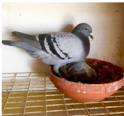
3 rd bird chequer hen