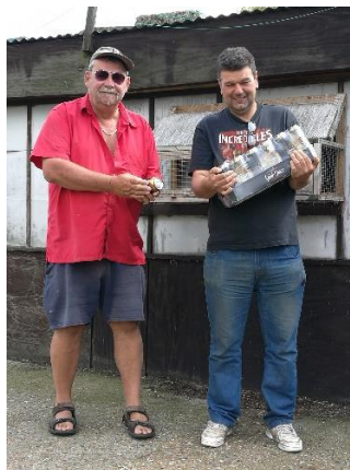
F Knowles & Son