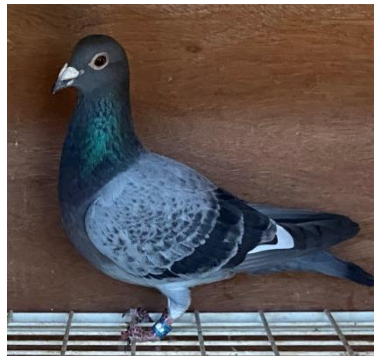
Tony's 2 nd bird