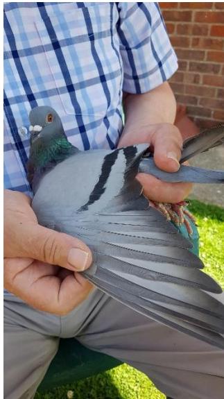
Brian Garnham's Blue Doro