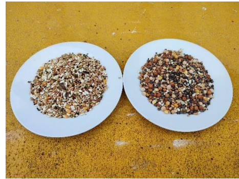
Bill & Beryl's racing mixtures