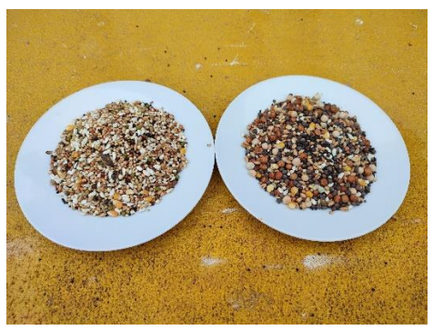
Bill & Beryl's racing mixtures