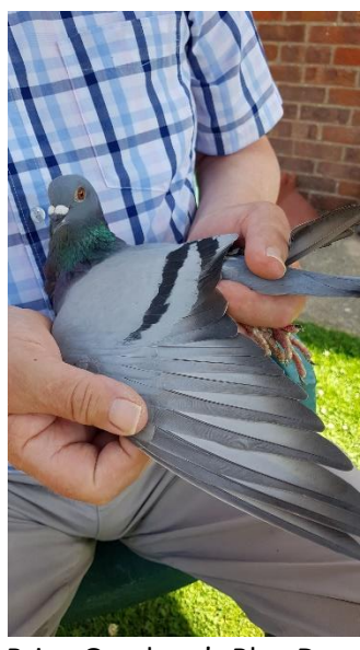
Brian Garnham's Blue Doro