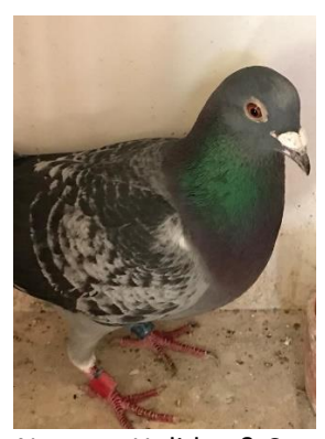
Norman Holiday & Son