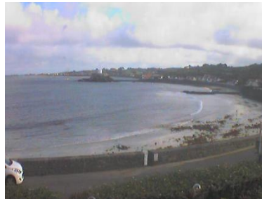
View of Saint Peter Port