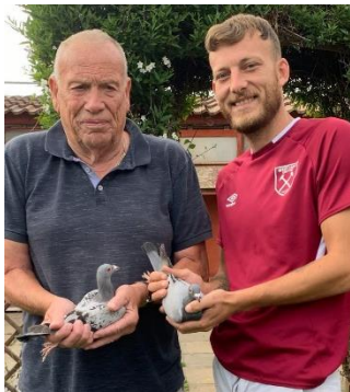
Topp & Mann