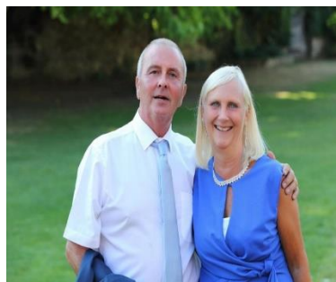
Sparks & Dallas