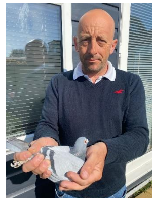
Chapman & Eastoe