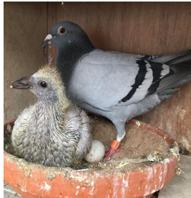
Gary Downing's bird