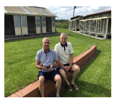
Booth & Roper