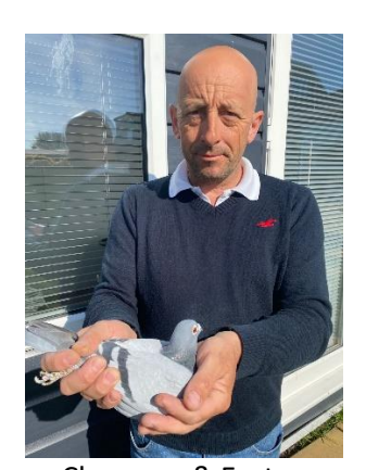
Chapman & Eastoe