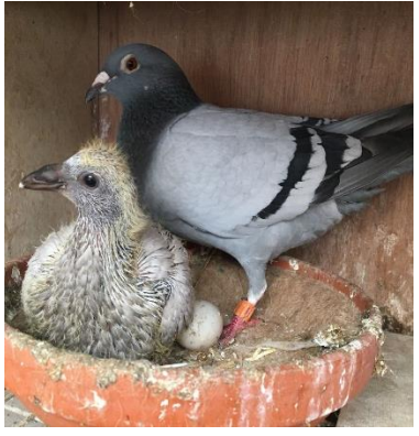
Gary Downing's bird