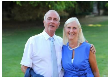
Sparkes & Dallas