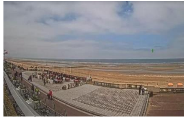
View over Cabourg