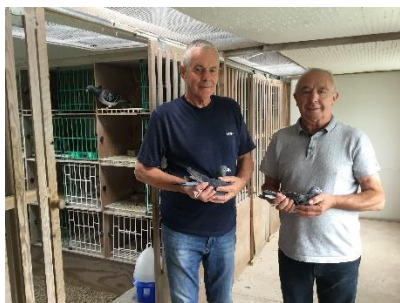
Booth & Roper