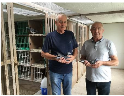
Booth & Roper