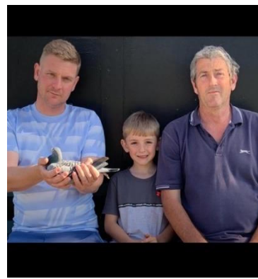
D Wilton & Son