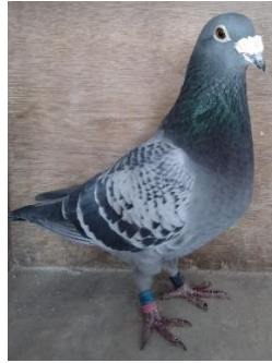
Dave Downing's widowhood cock