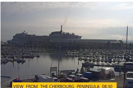
View from Cherbourg Peninsula

Our convoyers arrived Friday evening in Guernsey and were soon escorted to the liberation site. As expected, Saturday morning dawned bright with low lying mist affecting coastal regions and some areas of the Channel. As forecast, this quickly dispersed resulting in a clear flight path to southern England. This can be seen by the captured satellite image (Guernsey circled). The sky was clear of cloud all the way across the channel. This information was relayed to our convoyers who also reported weather conditions on site were very good and they prepared for liberation. Overall, conditions could not have been better for our first race. At 08:00 hours liberation was affected under clear blue skies. The convoy of 3219 birds cleared the Island immediately. The convoyers reported a light northerly wind, but wind direction did change to a light easterly over the Channel. Viewing the early times and considering the weather conditions, it would appear a successful start to the season for the BICC.