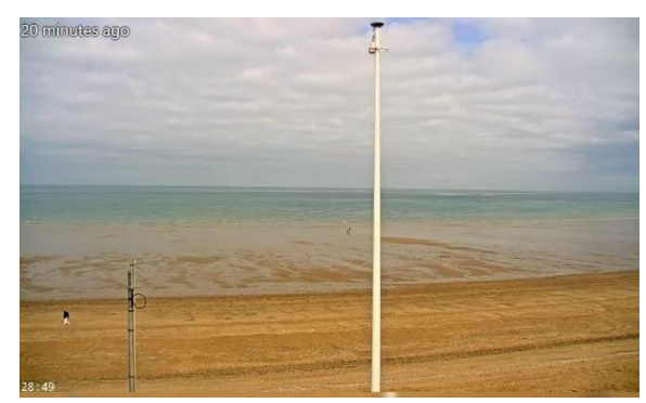
View of Jullouville

This report is based on member's first bird verifications and the final result may differ.