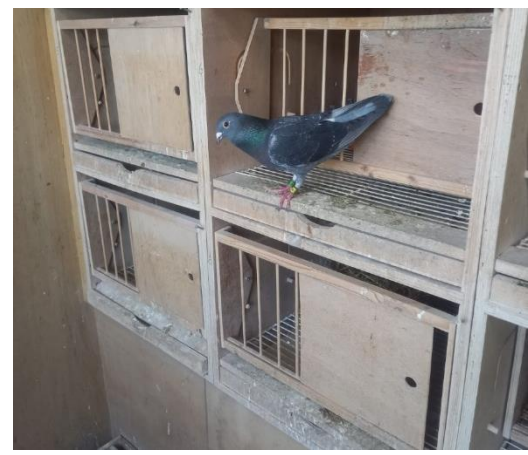
A Holdaway's bird