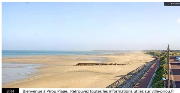
View from the coast on the Cherbourg Peninsula.