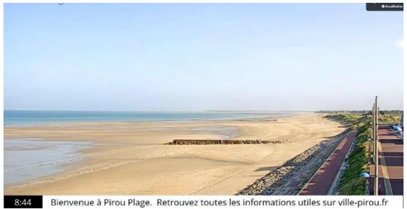
View from the coast on the Cherbourg Peninsula.