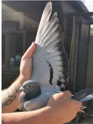
Wing of Open winner