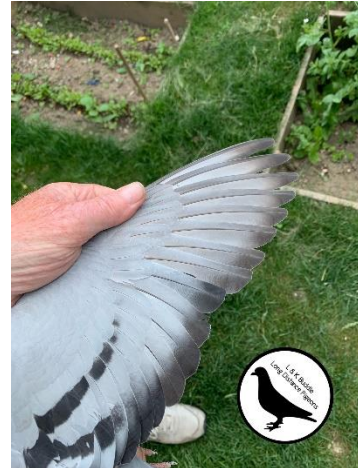
Wing of L&K Buddle's bird