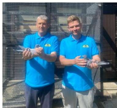
D Wilton & Son