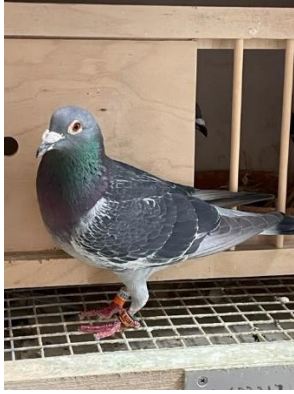
The National winning bird