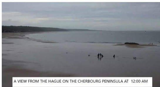
View from Hague

From a race and weather perspective the forecast for this BICC race from Guernsey indicated that the race would be fairly straight-forward, which proved to be the case. At first light a weather front carrying low cloud and rain positioned over Guernsey and the Channel obstructed the flight path to the south coast of England. This poor weather as forecast soon moved away north eastwards and by about 10:30 had cleared the Channel. Blue skies arrived over Guernsey switching on the green light for liberation and our convoyers cut the strings in preparation to release the convoy. At 11:15 the BICC pigeons were away clearing the Island immediately in one batch. The convoyers reported a fresh southeast wind over the Island, but the direction did change from about mid Channel to south south-westerly, which obviously produced a fast race. Visibility in the Channel was identified at 11 miles and more. The early times as expected confirm the high velocities recorded into many areas of the country.