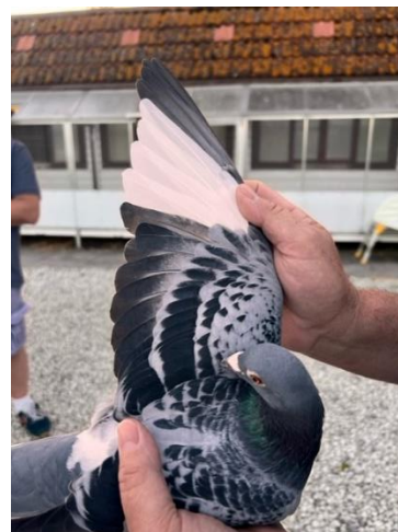
Wing of Southfield Gold