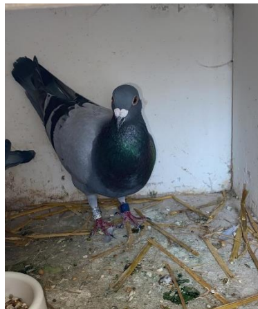
Brooks Bros & Wilcox