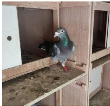
Popovici & Luca' bird