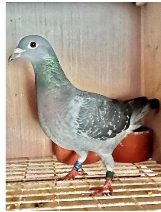
Paul's first day bird