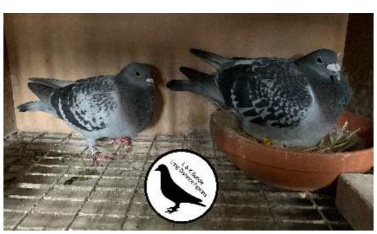
L & K Buddle's first pair back in the nest box