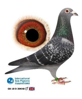
The 48's mother 168.