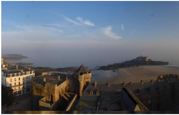
View of St Malo