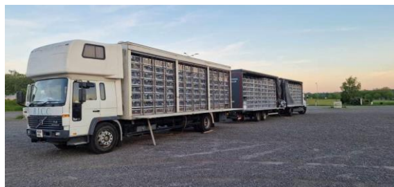
Transporters at Alencon

This was a BENZING - Gantner Pigeon Systems GmbH sponsored race and on Saturday 11 th May, Alencon played host to 6,178 birds from the British International Championship Club. If the numbers were down on the opening race from Guernsey, members made up for it at Alencon, with all sections contributing to a great birdage with 377 members sending.