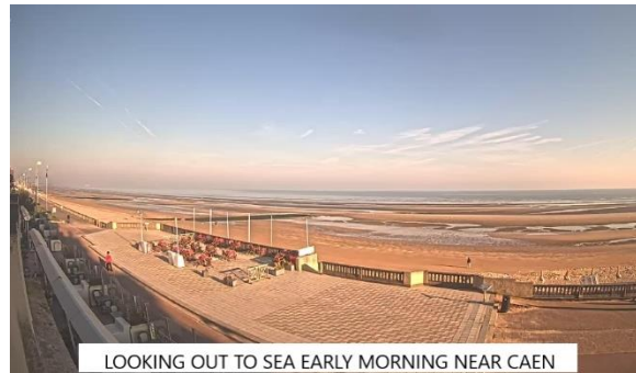
View from Caen

This report is based on member's first bird verifications and the final result may differ.