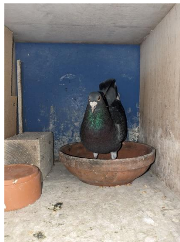
Summers Bros & Daughter's bird