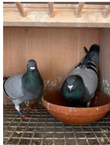
Tony Meader's bird back in its box