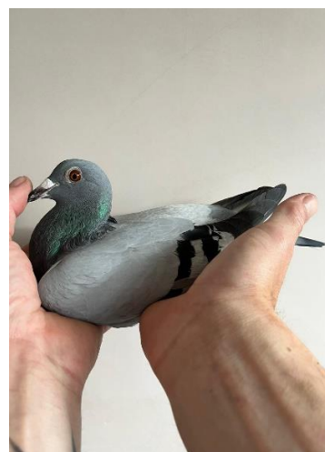
Shaun Saunders' pigeon