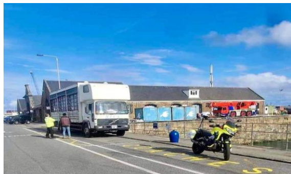
The transporter arriving at Guernsey