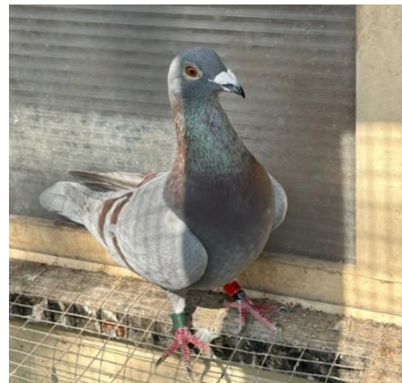
Dave Fisher's cock bird