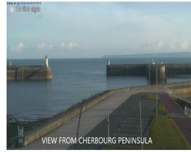
The Cherbourg Peninsula

This report is based on member's first bird verifications and the final result may differ.