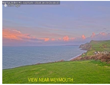
View from the west country