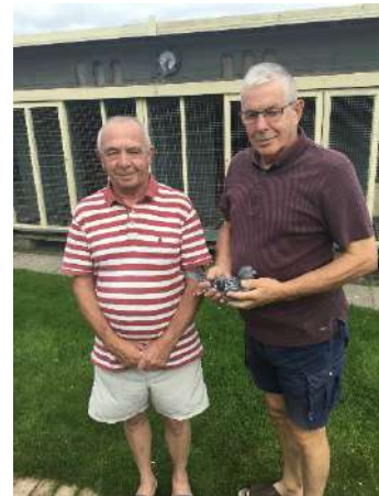
Booth & Roper