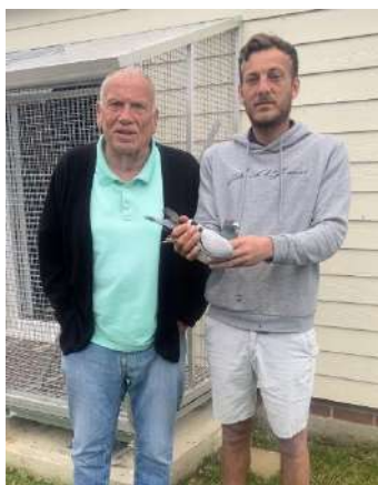
Topp & Mann