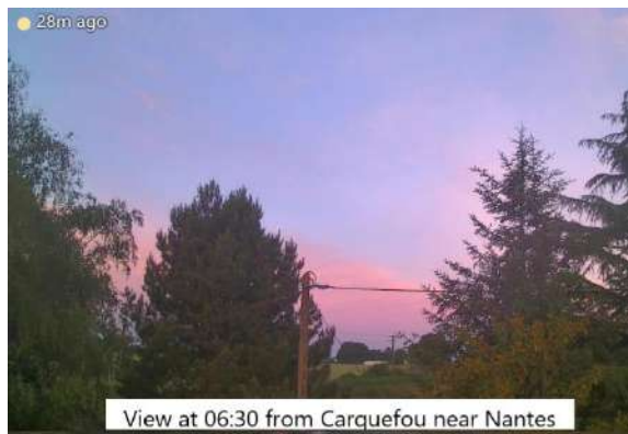
View near Nantes

Overall weather conditions for the combined organisations race from Nort-sur-Erdre were very good, due to the effects of high pressure extending across the flight path from the west. Liberation was effected at 06:30 under broken cloud and blue skies. The convoyers reported the birds cleared well into a mainly light northerly wind. The flight path through northern France was one of generally clear blue skies until the birds reached the channel where various cloud formations were identified over the open sea. Here the wind direction changed to a moderate west north westerly picking up in strength averaging speeds of 15 mph and more. Visibility recorded by the met buoys was 5 to 10 miles. Viewing the early times some excellent performances were achieved as the leading birds as expected were timed mainly into the east and central sections.