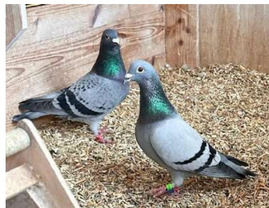
Geoff and Catherine Coopers 2 nd Section blue and 3 rd Section chequer