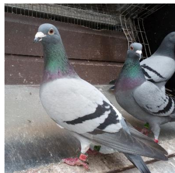
Kenny Pratt's blue hen