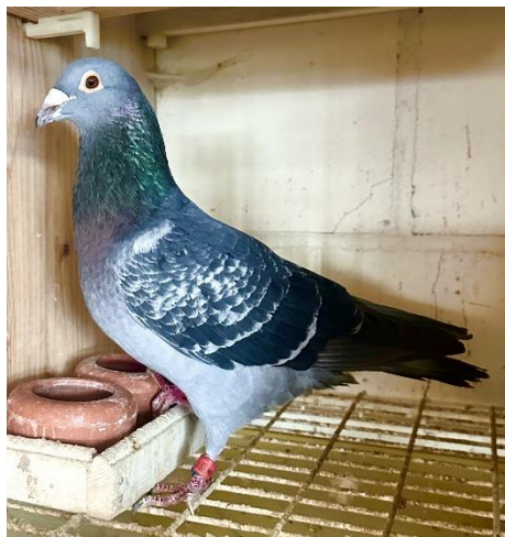
CSCFC Open winner