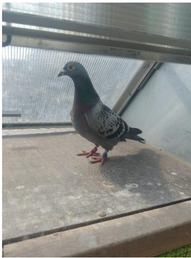
BICC Open winner

Jonathan also took the first four positions in the section, in a truly great performance. He placed, 2 nd Section, 29 th Open on 692.934, 3 rd Section, 98 th 451.643 and 4 th Section, 100 th Open on 438.025.