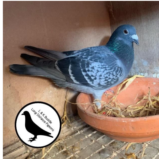
BBC National winner