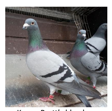
Kenny Pratt's blue hen