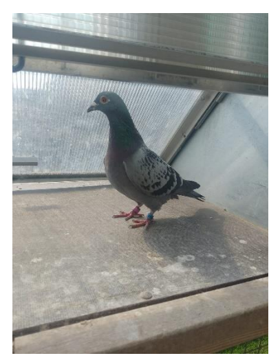
BICC Open winner

Jonathan also took the first four positions in the section, in a truly great performance. He placed, 2<sup>nd</sup> Section, 29<sup>th</sup> Open on 692.934, 3<sup>rd</sup> Section, 98<sup>th</sup> 451.643 and 4<sup>th</sup> Section, 100<sup>th</sup> Open on 438.025.